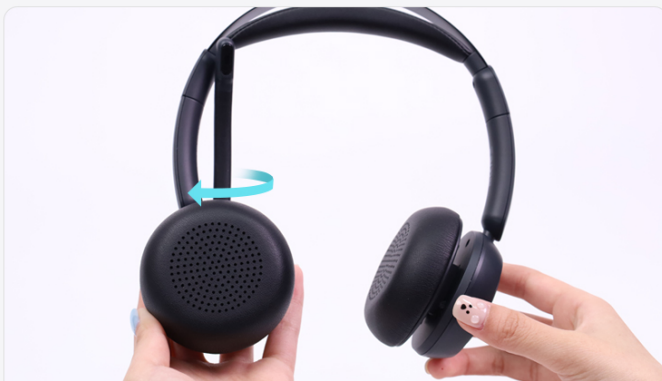
180° rotatable ear muffs

Minimize pressure on ears and head, catering to various head sizes