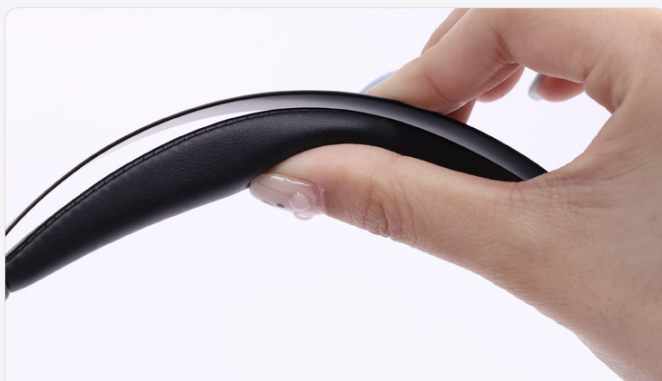
Soft padded leather sling